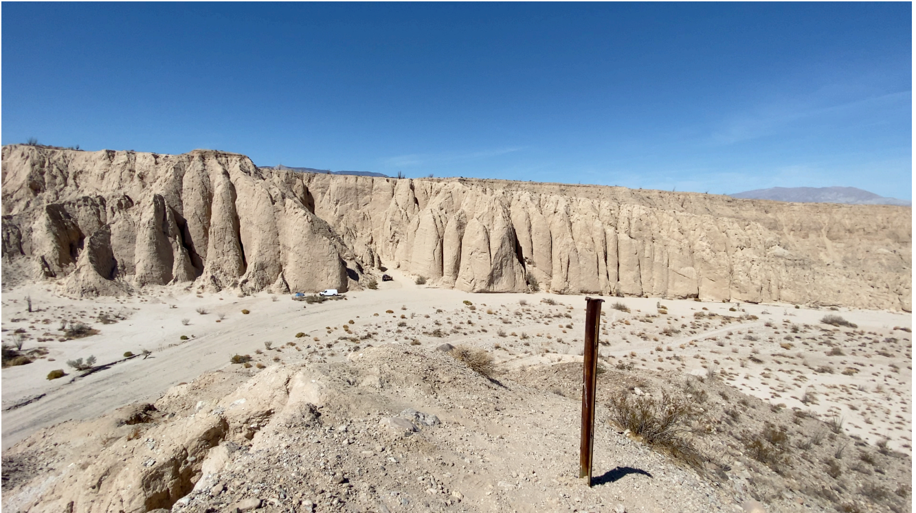
Sin Nombre Canyon, CA - Dec 5-8.

This is it. I made it to full on adulthood and I'd like you to celebrate with me.